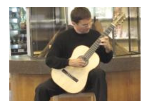
Listening to beautiful music.