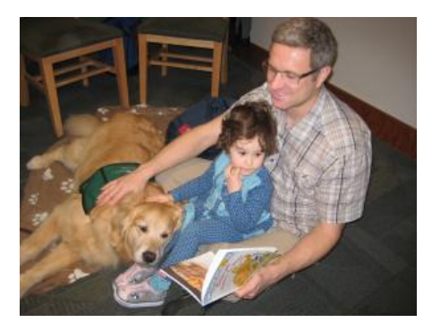
Volunteering to read a good story that can be enjoyed by all!